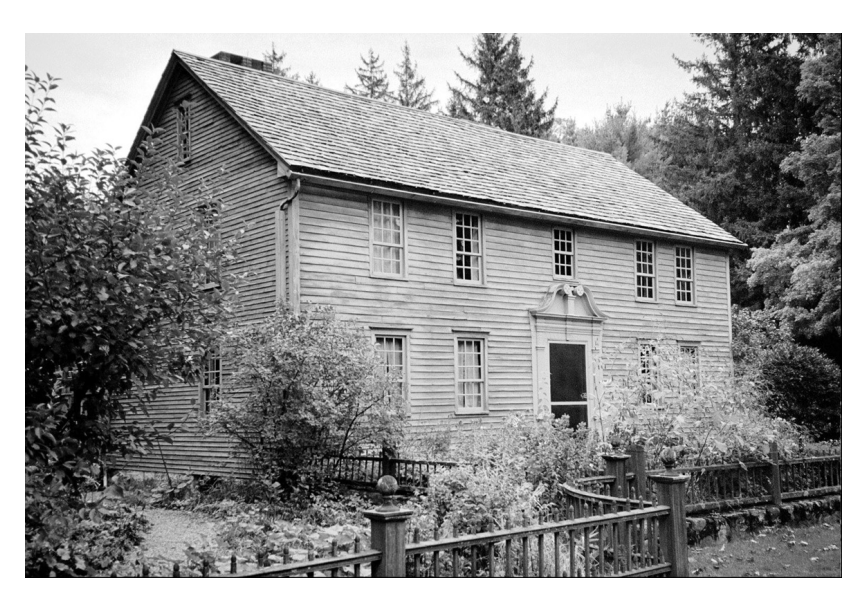
The 18th century Mission House at Stockbridge, Massachusetts,