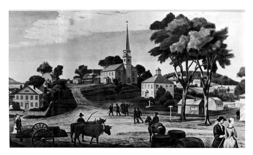
Northampton, Massachusetts in the 18th century with the first and second meeting houses.