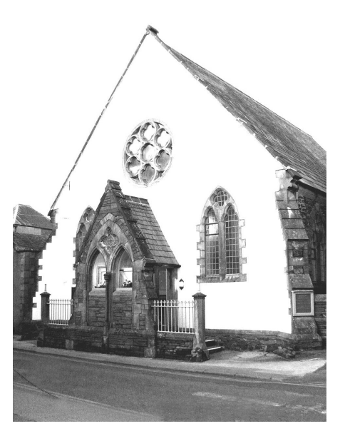
Keswick Congregational Church building and noticeboard