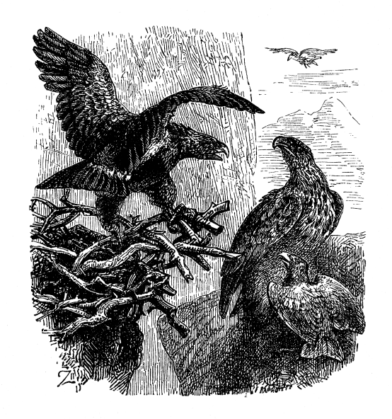
WITH ILLUSTRATIONS IN GRAPHOTYPE

By the Author of 'The Expositions of the Cartoons of Raphael,' etc.