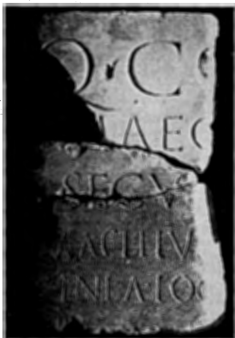
Macellum Inscription—Corinth, No. 124.