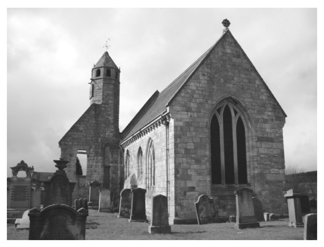
Douglas Kirk, where most of the General Meetings of the United Societies were held in 1689-90.