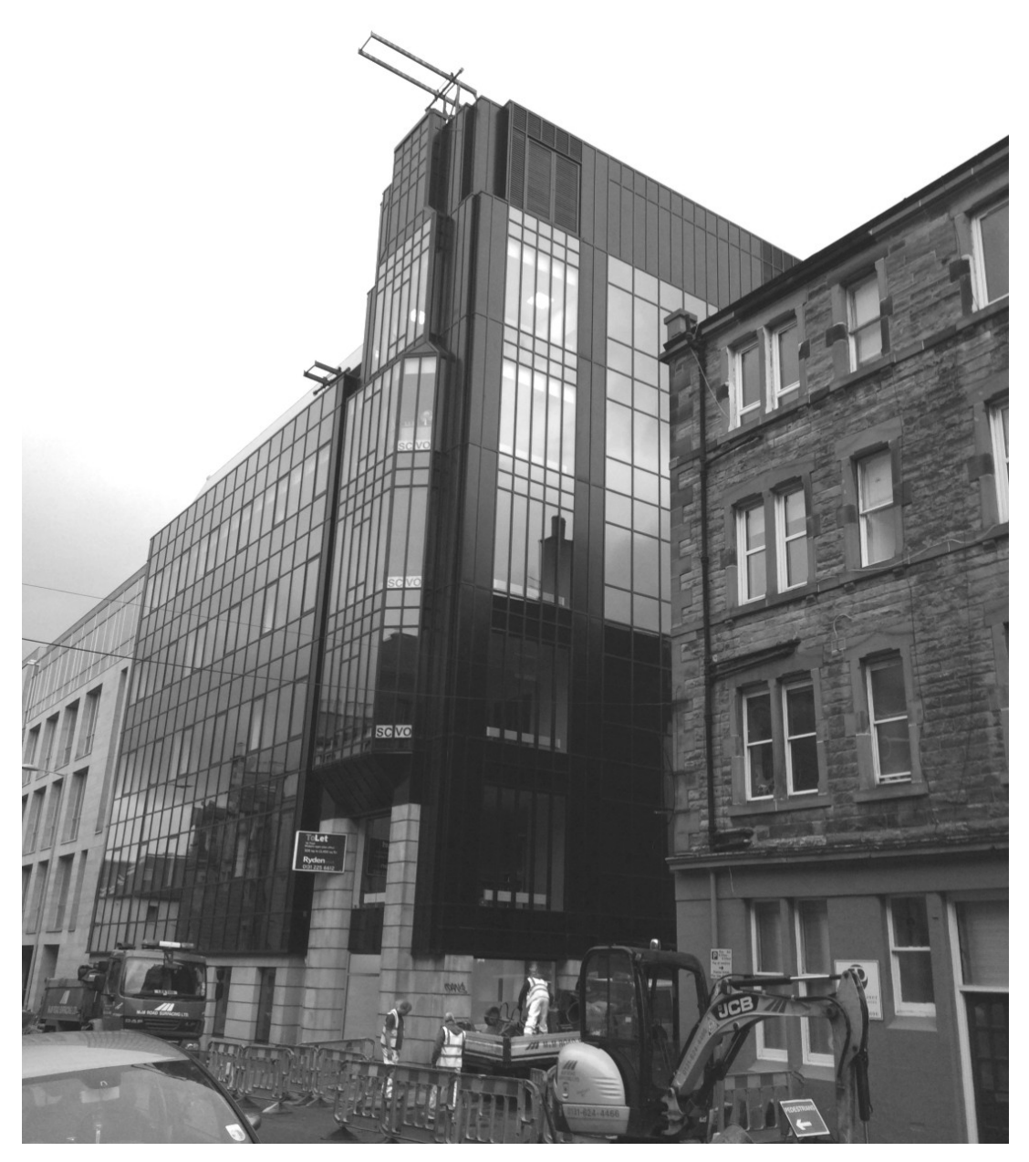
Lauriston Street in the present day. The gap between the tall glass building on the left and the older tenement on the right is the lane by which worshippers gained access to the Original Secession church.

held on the Friday.<sup>114</sup> In a list of services held at Lauriston Street during the October 1861 communion season, there is a tantalising hint of there being some kind of gathering for discussion, rather than preaching, on a Thursday evening – this in addition to preaching services earlier in the