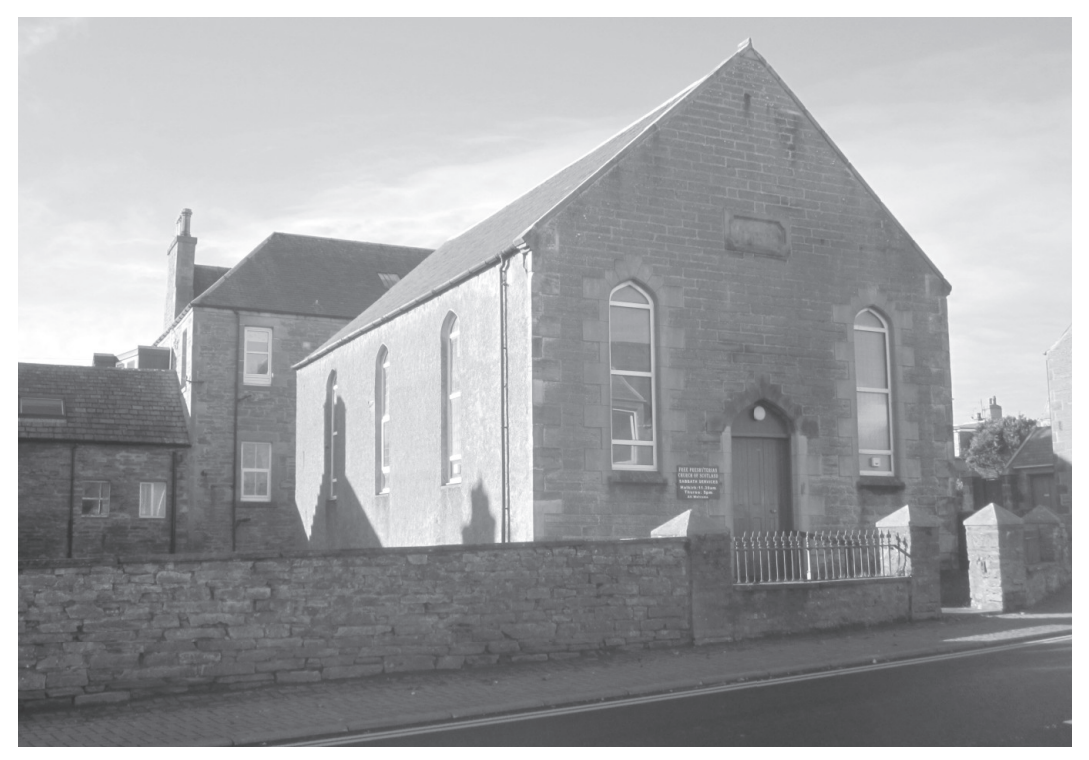
Above: The former RP church in Thurso, built in 1859. The congregation closed in 1928 and the building was sold to the Free Presbyterian Church of Scotland who continue to use it.

Below: Martyrs' Free Church of Scotland in Wick. Built in 1839 as an RP church, the building was retained by the Majority Synod in 1863, passing to the Free Church in 1876 and the United Free Church in 1900. It was sold back to the Free Church in 1914.