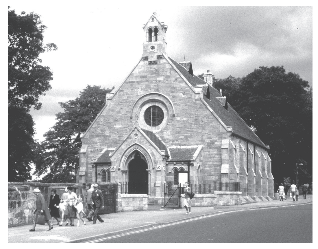
Wishaw RP church, 1984.

general trends and tone of the denomination as a whole, especially as these emerge from the activities of the leadership and its interaction with the membership at large. We know what absorbed the energies of the decision-makers and what issues most exercised them in the courts of the Church. And, now and again, we are afforded glimpses of the life of the body as a whole. Together, these provide materials for coming to some conclusions as to why things happened as they did.