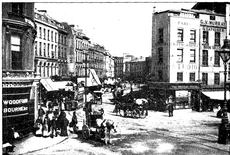
SITE OF DAUNT'S BRIDGE, CORK: CORNER OF PATRICK STREET AND GRAND PARADE.