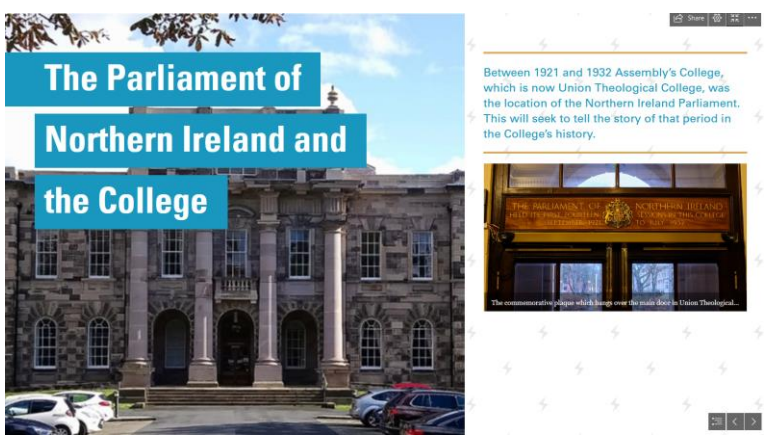
The Sway about the Parliament of Northern Ireland and the College.