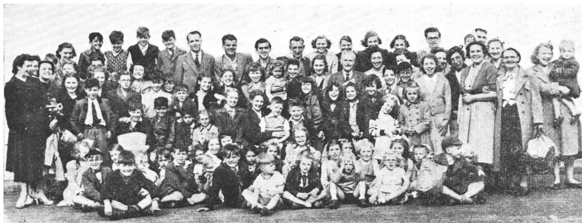
Happy memories of summer days by the sea still linger as the winter draws near. This picture shows the Sunday School from the Elim Church, Mason Street, Hull, at Hornsea, taken during their annual treat.