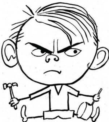
Is he in your class?

Two of the many stories which can be adapted for this are: (i) The widow's oil (II. Kings iv.). Select the chief characters: Elisha, the widow and her sons. The remainder of the children can be the people who lend their pots and vessels. (ii) The story of the axehead which swam. The chief characters in this story being Elisha, the man who borrowed the axe, and the person who lent him the axe. The rest of the class can be those who help to cut down the trees. Although this is only seven verses in II. Kings vi. more details can be put in, to interest the children.