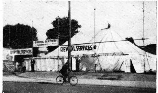
The Campaign Marquee, Hull

At every service musical items were given by members of the church.