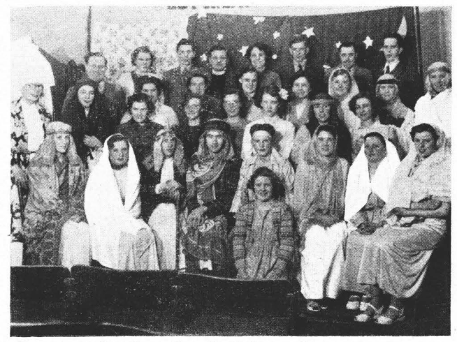
Scunthorpe Crusaders in Eastern Costume

Scunthorpe Youth send their greetings to all other groups, praying God's blessing on them all.