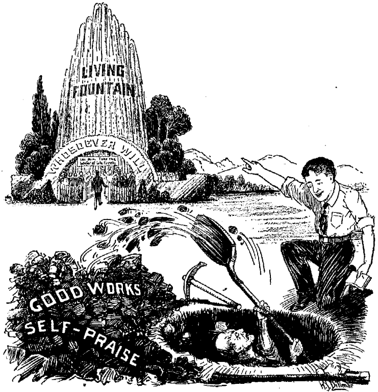
HE MUST SECURE WATER FROM THE NEARBY FOUNTAIN OF LIFE

The following instances of knowledge of persons and