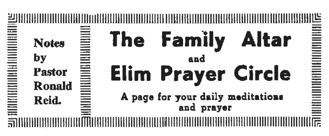
Scripture Union Portions.

THE E.Y.M. FILM-STRIP LIBRARY. 20, CLARENCE AVENUE, CLAPHAM PARK, LONDON, S.W.4.