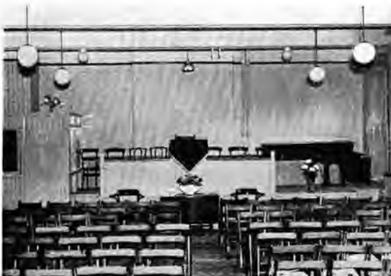
New Elim Church, Dewsbury.