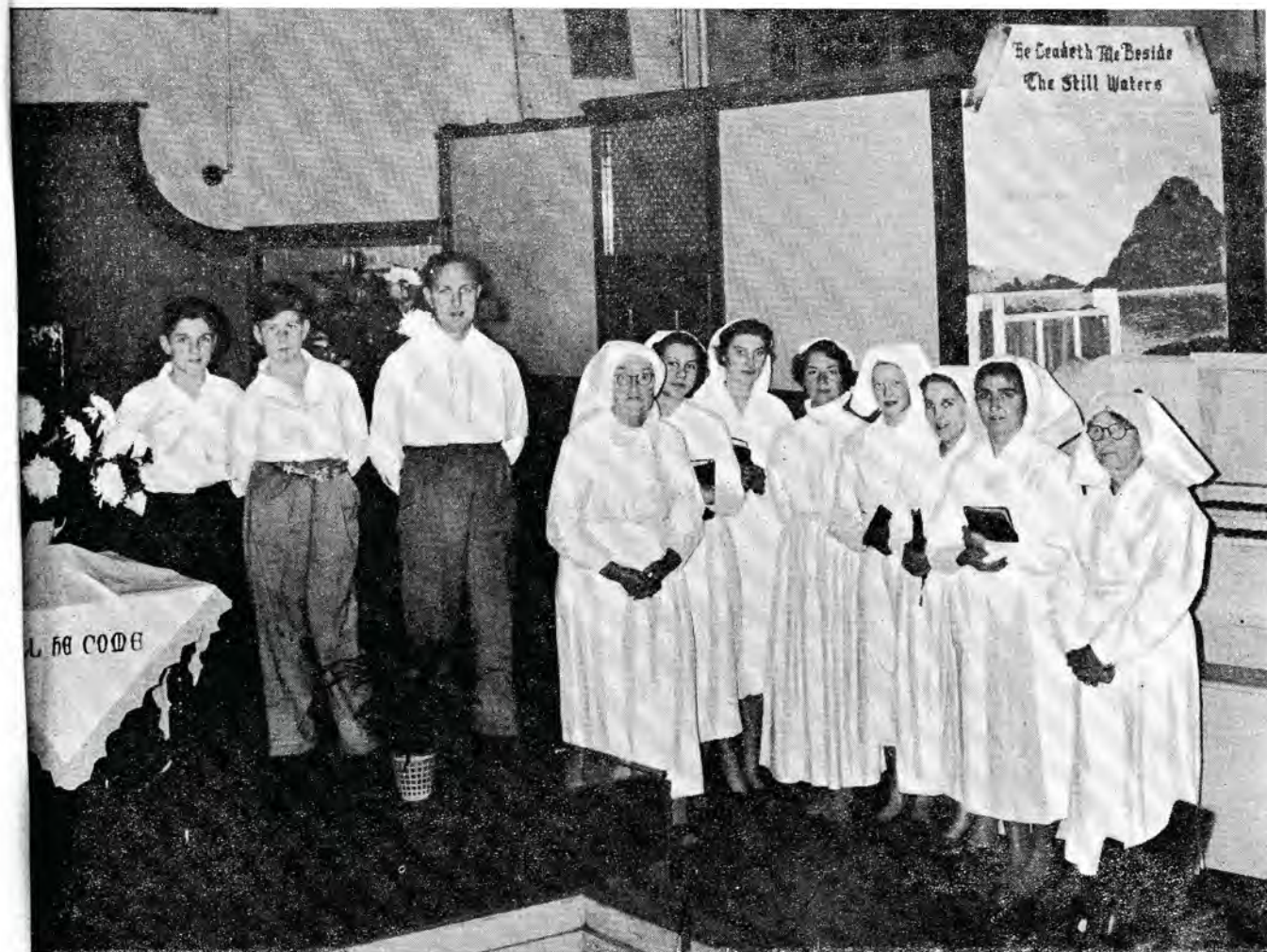
Members of the Chelmsford and Dunmow Elim Pentecostal Churches combine for a Baptismal Service.