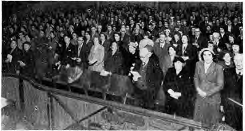
Crowd inside Alexandra Theatre.

Now came discussion time and questions, from the verbal inspiration of Scripture to the state of the heathen in the judgment were submitted. Questioned and cross-questioned, the evangelist unravelled each problem as it was proffered; not once was there a semblance of hesitation or doubt. Whether prompted by cynicism or genuine need, each onslaught of