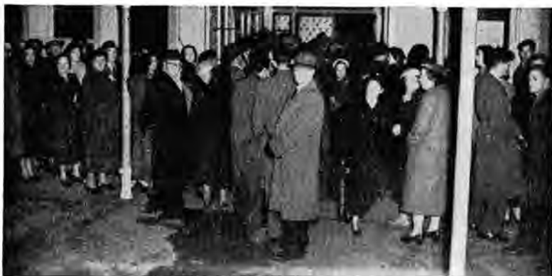
Crowd outside Alexandra Theatre.