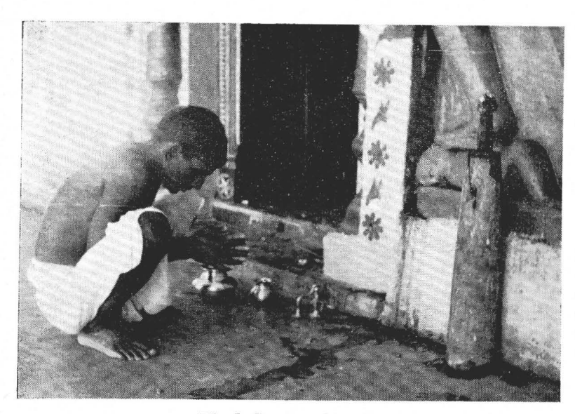
The Indian worships his god.

The second picture was taken by flashlight during a lantern service held in a village twenty miles from our home. No one had