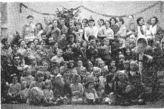
Whitehaven Sunday school party.