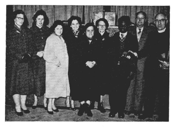
(Continued on page 236)

Some of the people healed in the campaign.