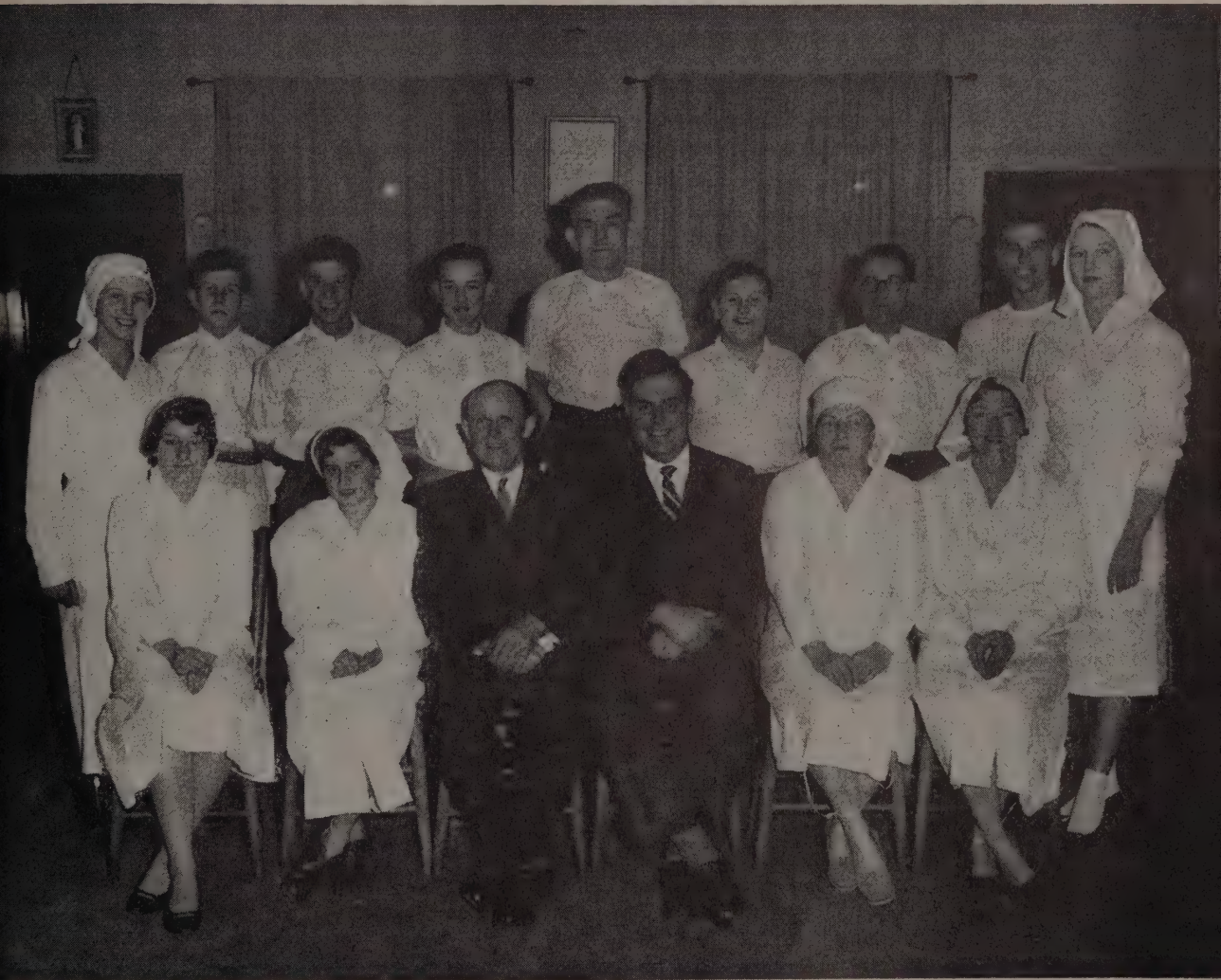
Baptismal service at Malton (see page 99).