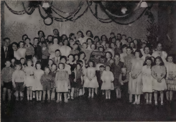
Edinburgh Sunshine Corner Party