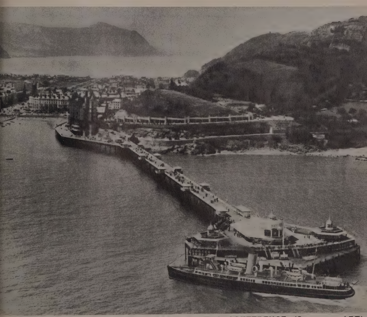
LLANDUDNO—VENUE FOR THIS YEAR'S ANNUAL CONFERENCE (See page 157)

Vol. XL. No. 10 PRICE 5d. March 7th, 1959