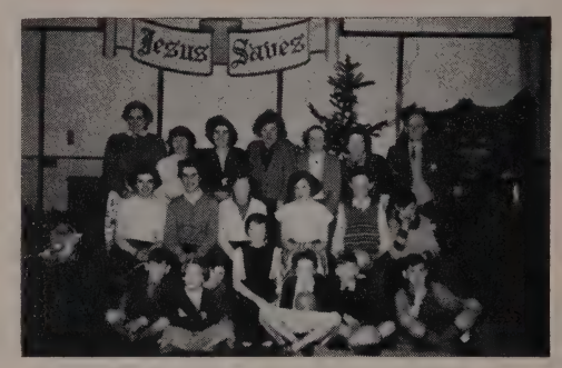
Hadley Sunday school in 1958

The Hadley Elim Church is the only Elim work in the county of Shropshire. It is only during the last six months that Elim has taken over this church. Despite the many difficulties, God has honoured this venture, with the result that in every department of the church there has been a marked improvement. For instance, in September there were a mere handful of children attending the young people's services, but one glance at the photographs