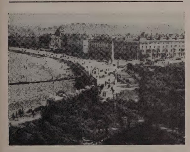
Above is a view of the north shore of the Llandudno sea front which can be seen from Happy Valley.

FOR YOUR CHURCH TO ARRANGE A COACH PARTY for one of the evening meetings if you are within reasonable travelling distance.