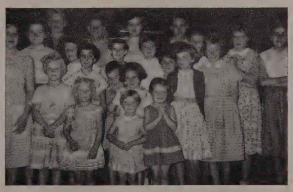
Children at Lincoln "Sunshine Corner" campaign.