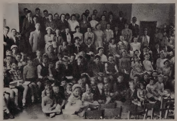
Sunday school anniversary at Leigh-on-Sea.