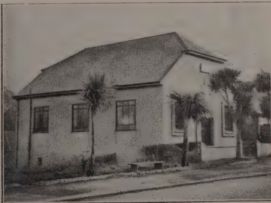
Falmouth church in its delightful setting.

At the thanksgiving service, pioneer members took