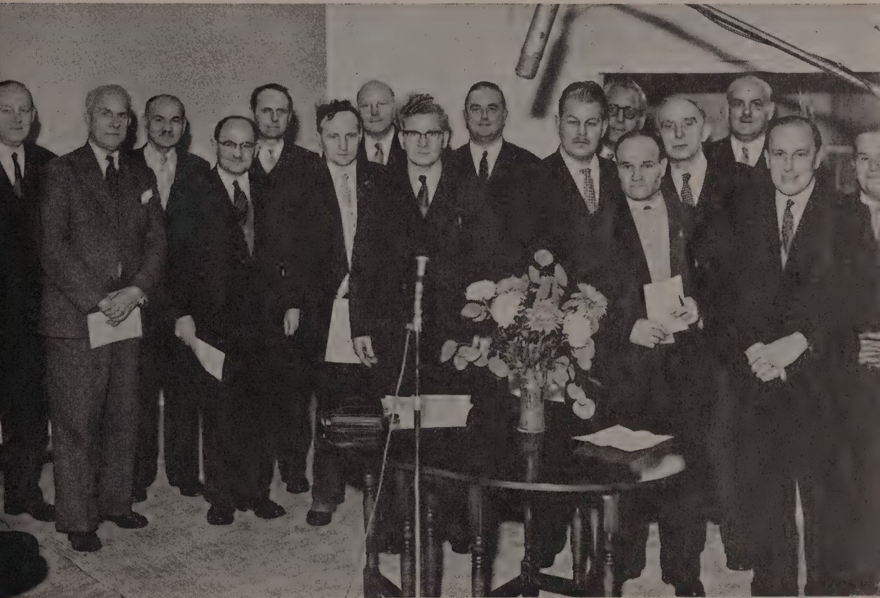
OPENING OF NEW IBRA RADIO STATION AT LUTON (see page 23)