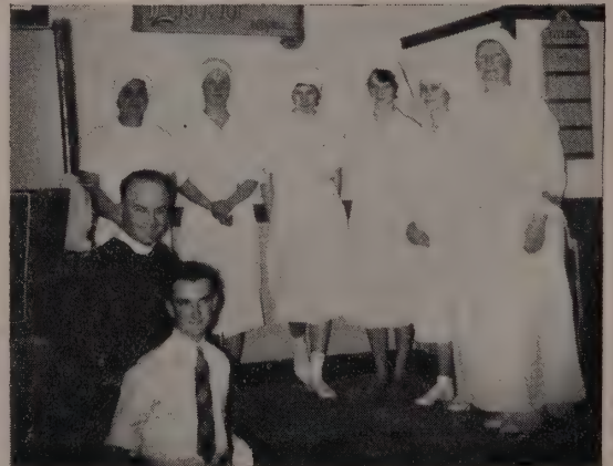
Falmouth baptismal service.