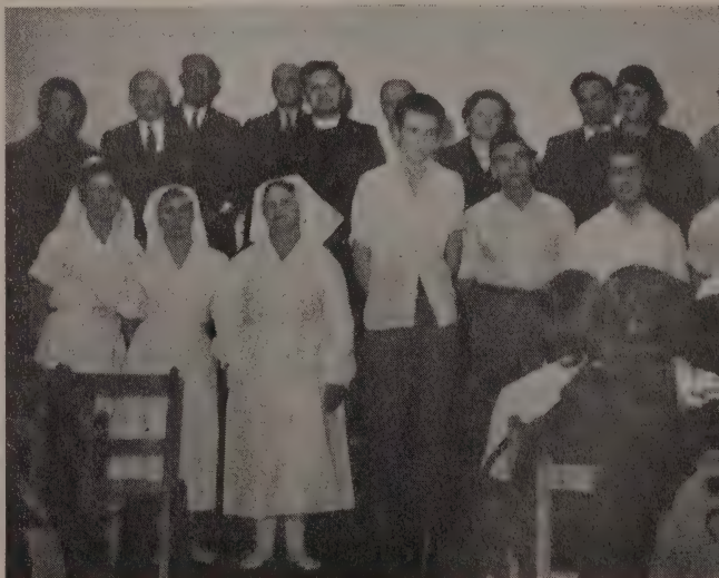
Candidates baptised recently at Ealing.

A water baptismal service was held on a recent Sunday evening, when seven candidates (mostly young people) were immersed and God set His seal to this service by the addition of seven to the Lamb's book of life and by the desire of several others to be baptised at the next opportunity. We praise God from whom all blessings flow and are looking to Him for greater things in the days ahead.