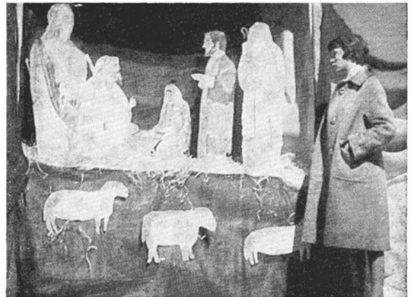
A York Crusader looks at the manger.

blessing of the breaking of bread service in the York church on the Sunday before Christmas. Four of the new members are the mother and father and two brothers of a sister in the church who prayed much for their conversion. We praise God for this evidence of answered prayer. Two of the babies dedicated are cousins, grandchildren of our church treasurer. In the evening a carol service was led by the Crusaders entitled "From the manger to the Cross."