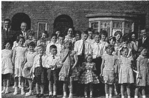
The fine Sunday school at Old Hill.