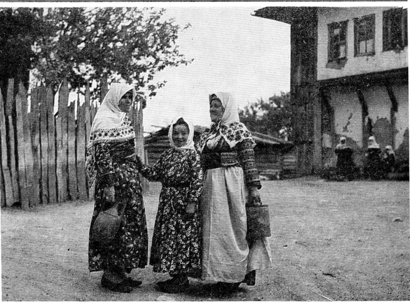
I. XLIV No. 48 NOVEMBER 30th, 1963 6d