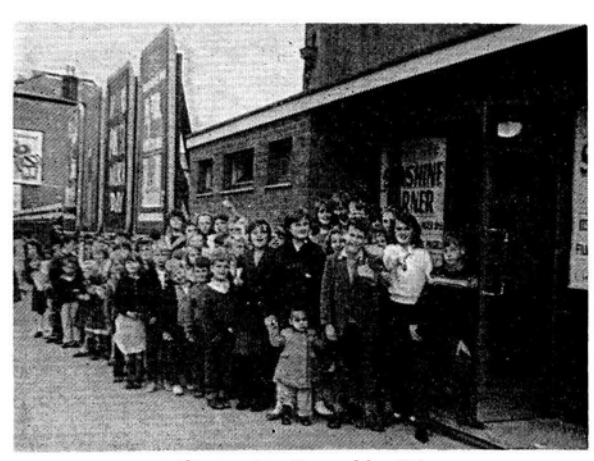
Queue for "sunshine"!

Away back in January our local youth committee planned to have a children's campaign for five days during the last week in September. It is now past and gone, but what a time it was! The queue formed an hour before the starting time—the photograph shows that queue with over 100 in it. The numbers ranged each night from 380 to 440. What is more,