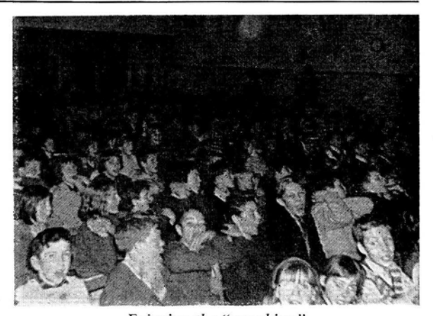
Enjoying the "sunshine."

we had far more boys than girls. Well, now what? We have Sunday school in the morning as well as the afternoon, and in both there is an increase of over fifty children. Our midweek Sunshine Corner has increased from forty to fifty to well over the 100. What are we doing about all those boys? The answer is that we are starting a boys' work and have got together a good band of men who are keen and willing to win them for the Lord.