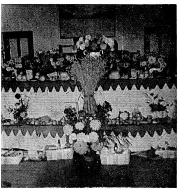
Harvest thanksgiving display.