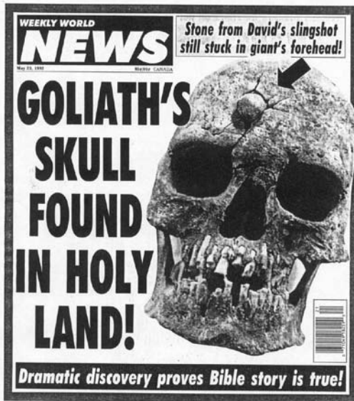
Picture 1. Example of caricature

Christian apologists use the same equation when they use archaeological data. First you isolate an event in the biblical text, then you postulate a specific object that must be found, forcing a simplistic direct one-to-one correspondence. For example, if the event is the biblical flood, then you go find Noah's ark; if the event is the Exodus then you go find Pharaoh's chariot wheels, parting of the Red Sea, or Mt. Sinai. This approach is the result of an incorrect understanding of the revelation of the biblical text and the nature of the archaeological enterprise. Simply stated, you take a reference in the Bible and show that this reference is supported by extra-biblical data (e.g. texts or material culture). Any use of archaeology is solely within a historical framework. Usually most arguments are framed in the equation, quoting a biblical text (e.g. Luke's census during the birth of Jesus) and equating it with a historic text. Apologetic works typically use this approach. 30 This simplistic equation does not take into account the nature of the archaeological data nor the nature of God's revelation.