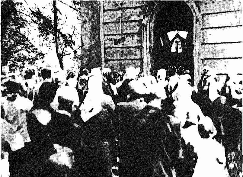
A group of Ukrainian Catholics gathering for prayer outside their church, which has been forcibly closed by the Soviet authorities.