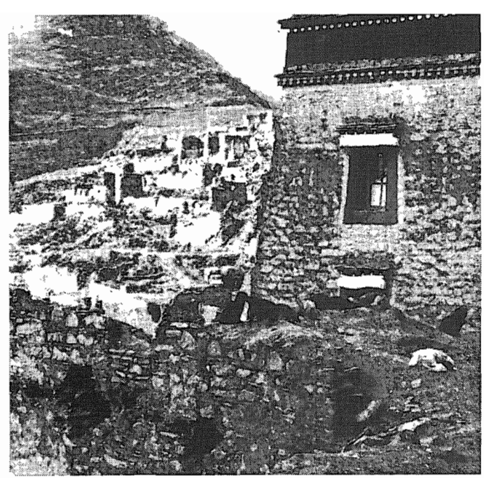
The Ganden monastery, about thirty miles from Lhasa. It was destroyed by the Red Army, but the building in the foreground has been restored. The well-behaved dogs are a feature of Tibetan life.