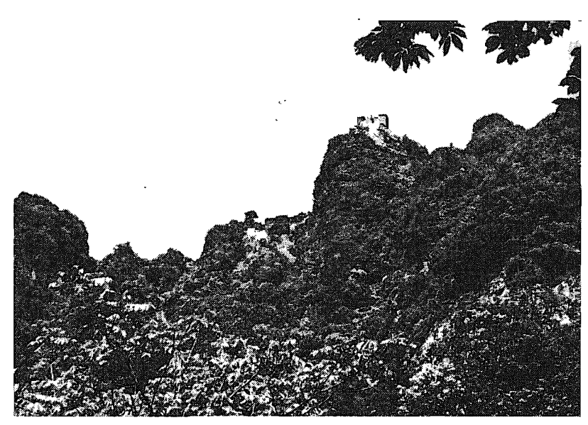
The Daoist monastery at the top of Mt Wudang, China. The walls of this ancient Yuan fortress are still in good condition.

See article on pp. 135-145.