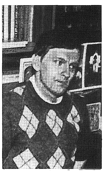
Dean Modris Plate.