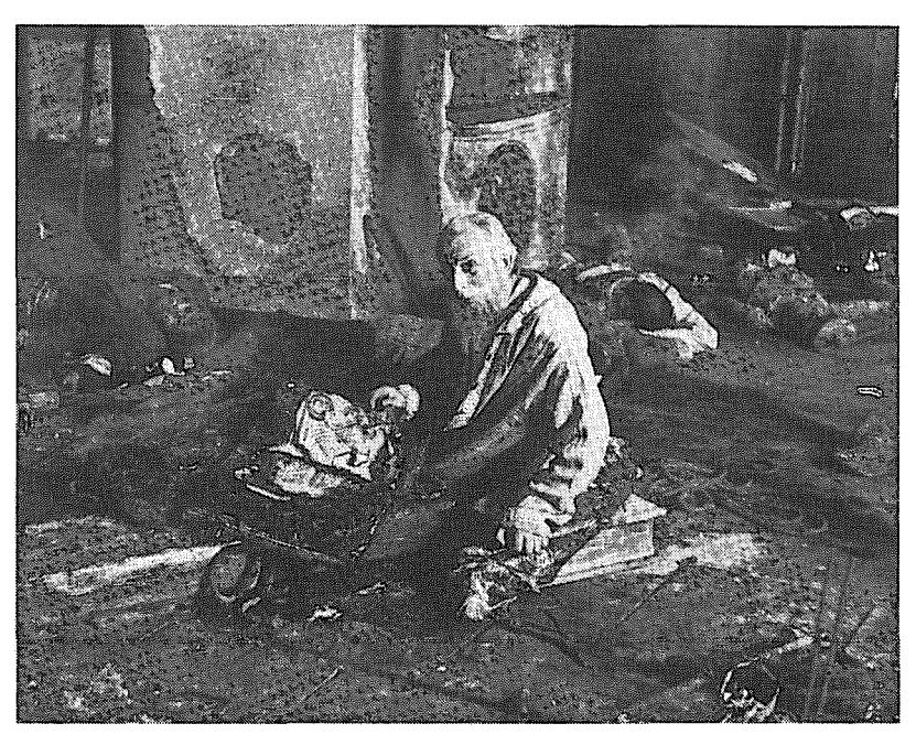
Scenes from Tarkovsky's film Andrei Rublyov. See article on pp. 210-226.