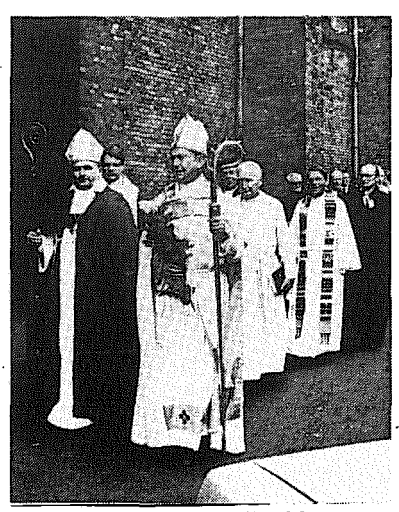
The consecration of Eriks Mesters as Archbishop of Latvia, August 1986.