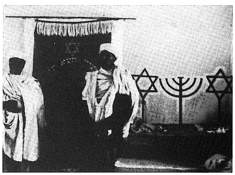
Khases (rabbis) in the synagogue at Ambovar.

See article on pp. 247-56.