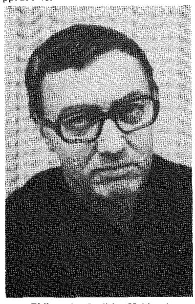
Philosopher Ladislav Hejdanek